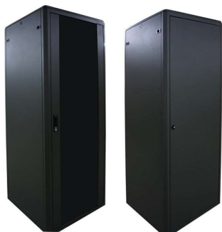
Front - Glass Door Rear - Single side door

SPCC cold rolling steel plate, mounting angle: 2.0mm, frame, front door 1.2mm, others 0.8mm