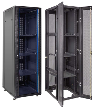
Front Door Rear Door