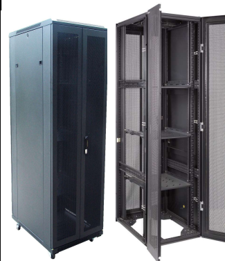
Front Door Rear Door